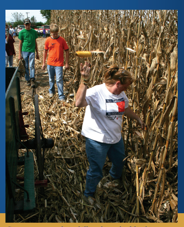
Contestants test their skill at the task of husking corn by hand. Men, women, youth and senior citizens compete in their respective class for husking trophies.